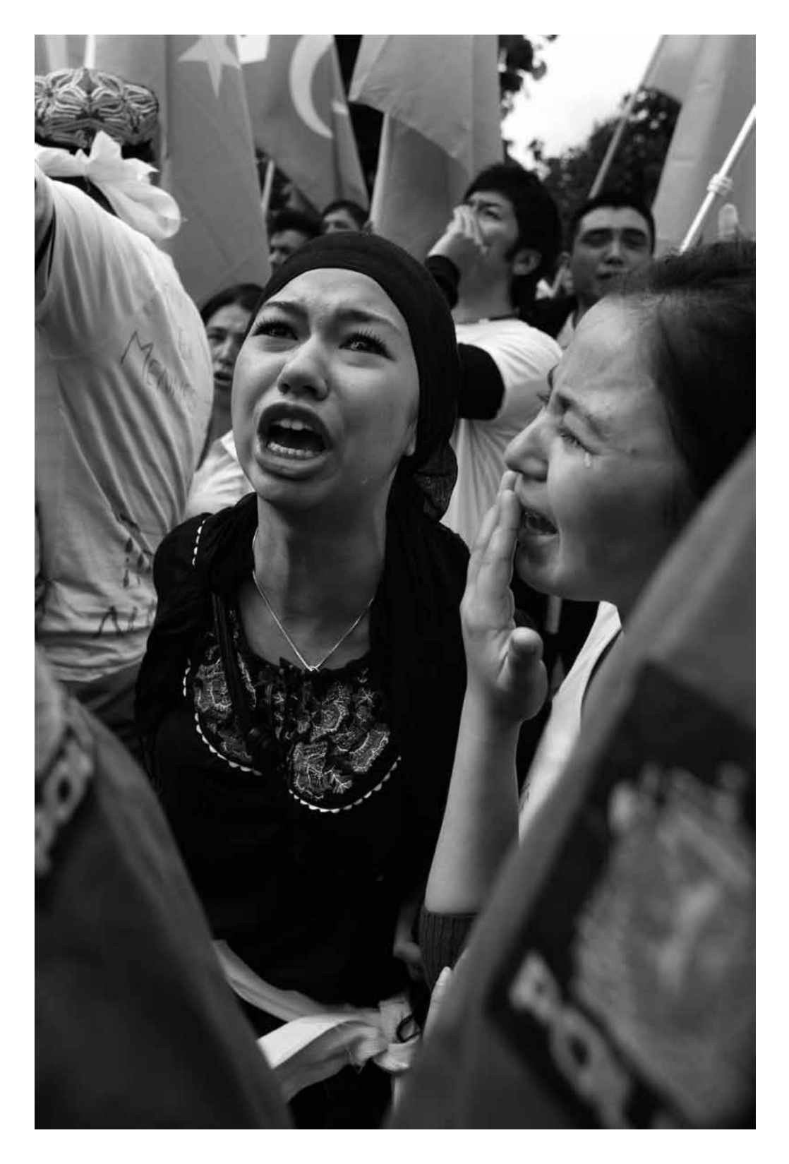
State of the World's Minorities and Indigenous Peoples 2011