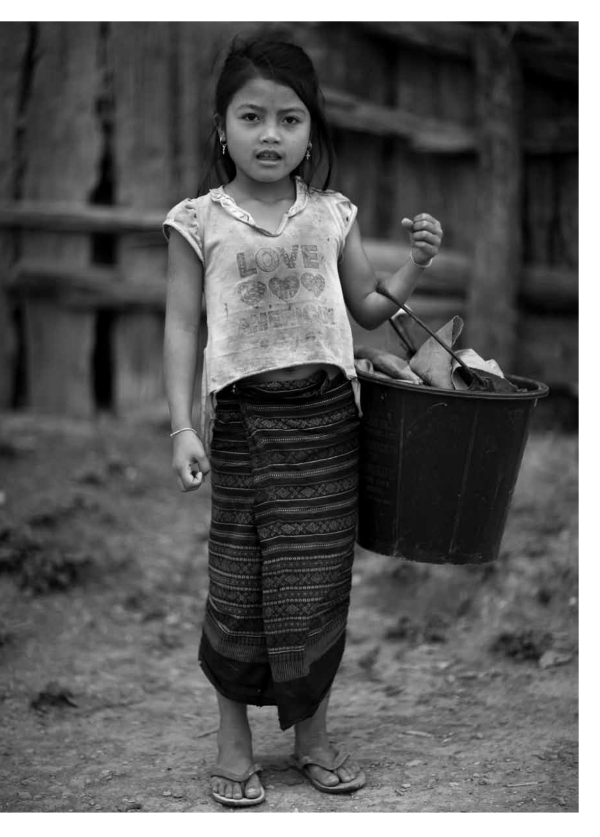
State of the World's Minorities and Indigenous Peoples 2011