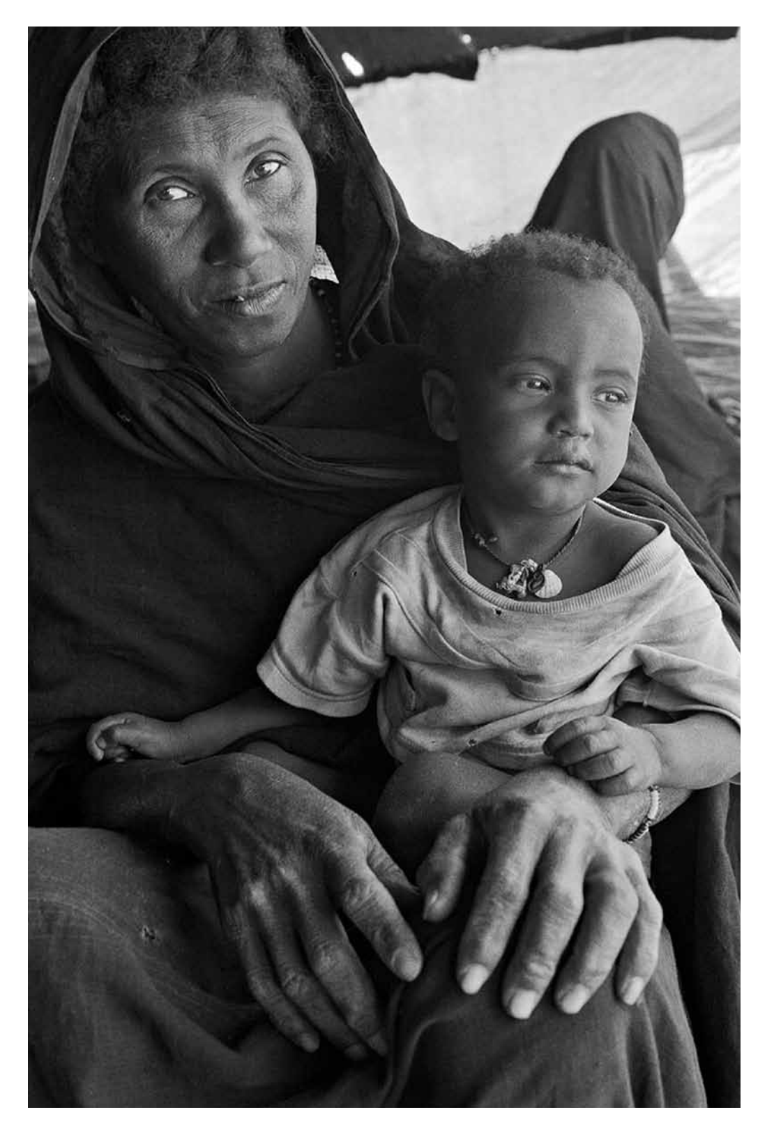
State of the World's Minorities and Indigenous Peoples 2011