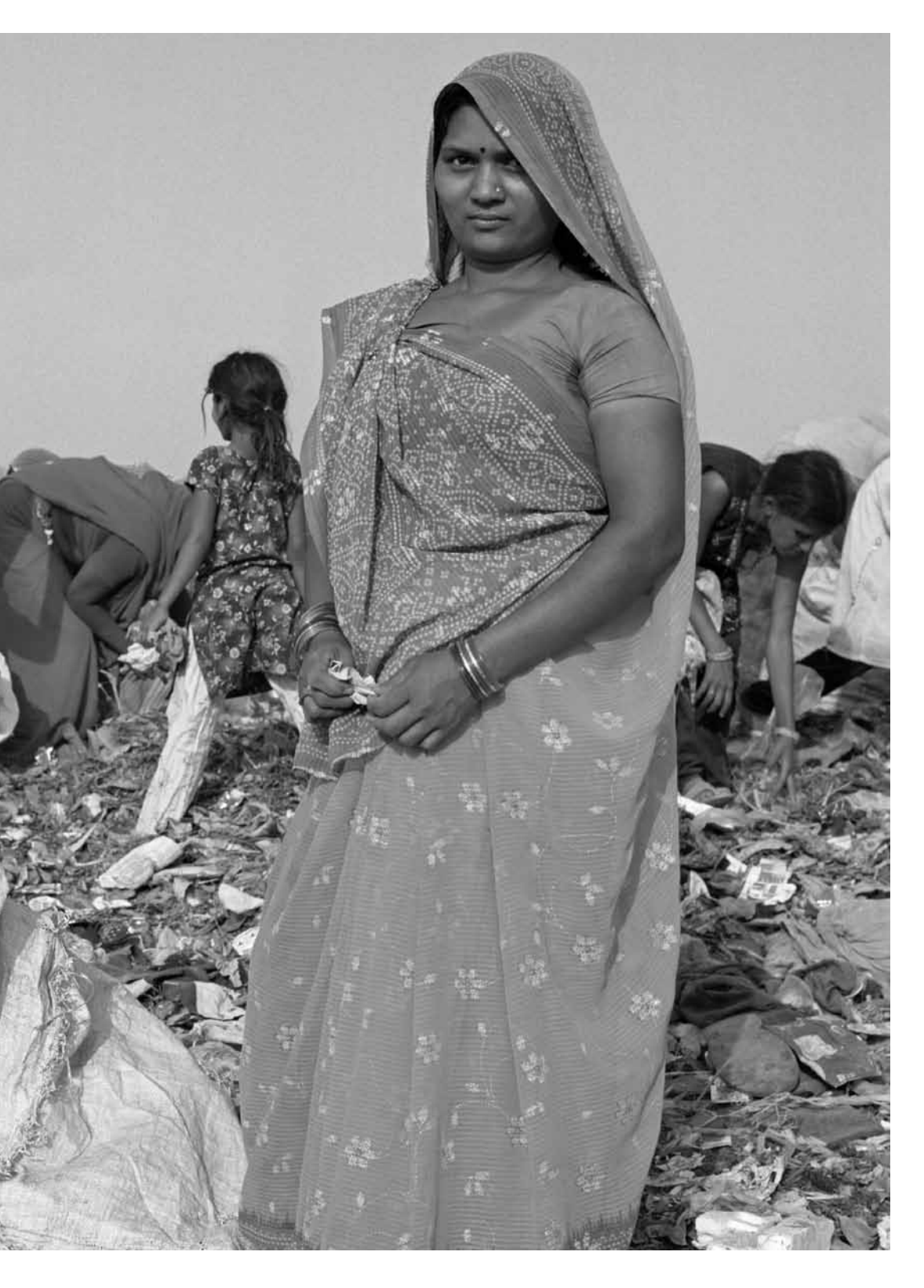
State of the World's Minorities and Indigenous Peoples 2011